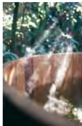
Detail TB K 153