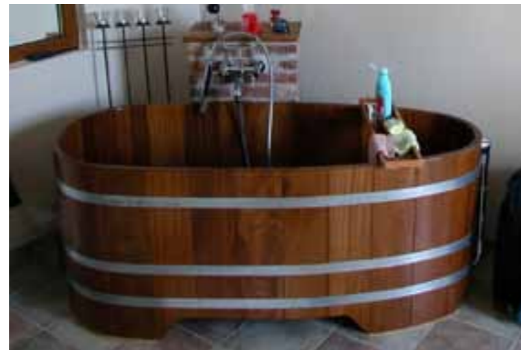
BW K 167x73x70 Kt, UL Chr