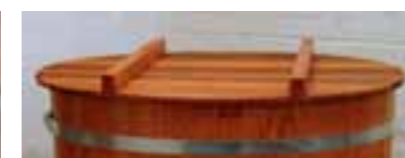
Cover Red Cedar / outdoor varnish