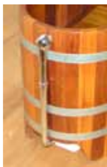
UL Chr BW