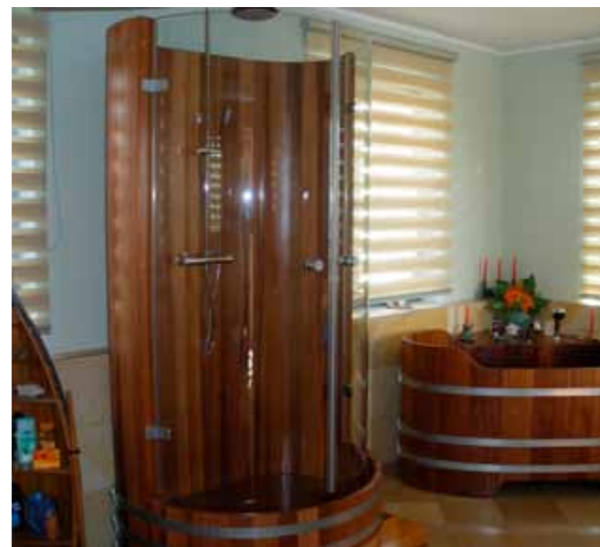
DK RC, V2A, ST DK, ME DK (+ BW K)