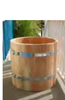
PB L Ø63x70 natur