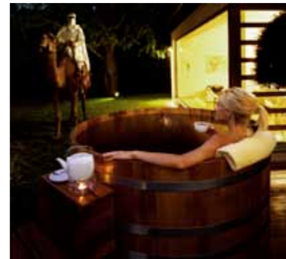
TB K Ø153, V2A XXL, Outdoor

Regulate the temperature by heating time and intensity or by adding cold water or closing the air intake.