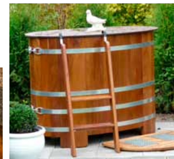
TB K 130x79 + cover plywood / outdoor varnish

Stainless steel hoops („INOX“) instead of hot dip galvanized hoops. See chart below, prices for complete set of hoops. Outdoor varnish at tub's outside + cover made from Western Red Cedar clears or thermotreated plywood for sheltering the tub's inside (see chart below. The extra price is compared to version "clear coated all around"). Always needed if tub should be used outdoors. If ordering only "outdoor varnish without cover" you must equip the tub with a cover afterwards by your own or you have to order the tub coated inside blue or black instead of clear.