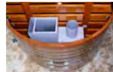
Unterwasserofen / snorkel stove