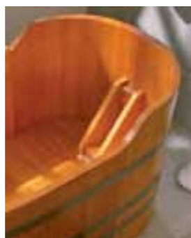
RL F + OWR