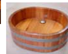
WB K 65x52, Clicker