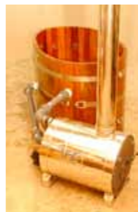
BWK 161x79 + Chofu

stove, placed beside tub, connected to the tub (as additional equipment to tubs with cover and outdoor varnish)