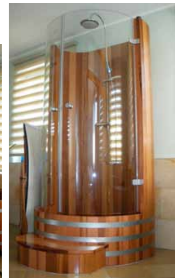
DK RC, V2A, ST DK, ME DK