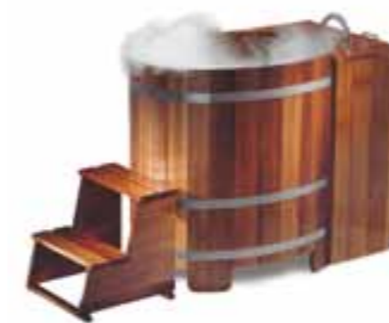
WP K 100x72, V2A, LB