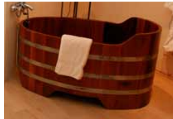
BW K 130x79x60/70 Kt