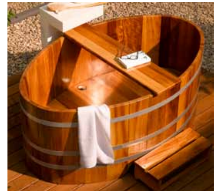
BW K 168x106x70 V2A, TAB, TS