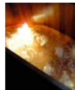
WW K + UWS