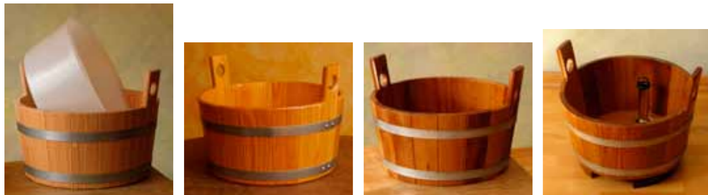
410/01 + ES FW

(*) Nature wood foot baths (art.no. 410/01 and 410/02) must be used with plastic insert art.no. "ES FW" to avoid leakage.