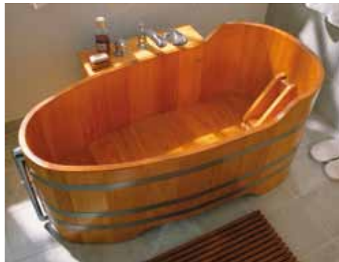
BW L 151x73x60/70 Kt, UL Chr, RL, WA along, V2A