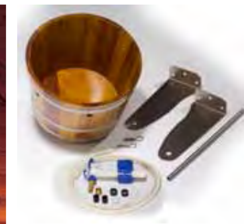
Einzelteile / Lieferumfang 522/05 (separat parts 522/05)