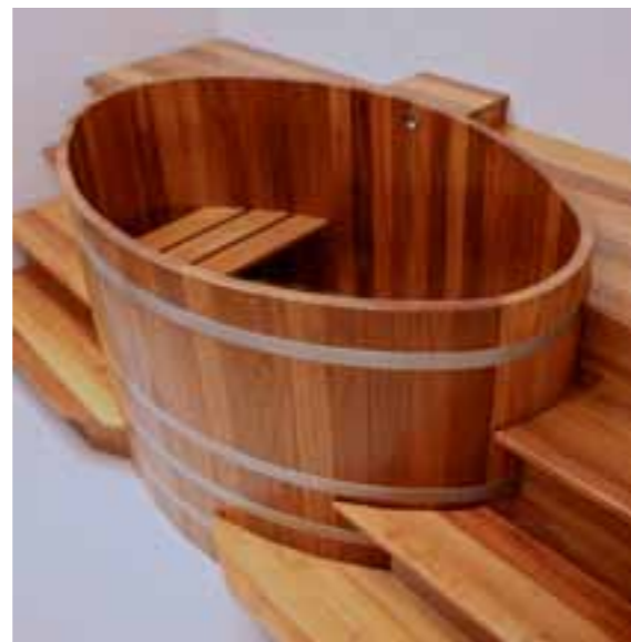
TB K 168x106x100 + 5 x IS120K + UL + „Specials“