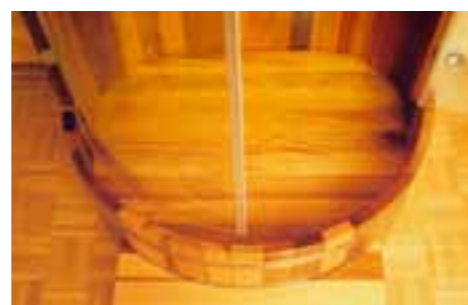
DK RC, ST