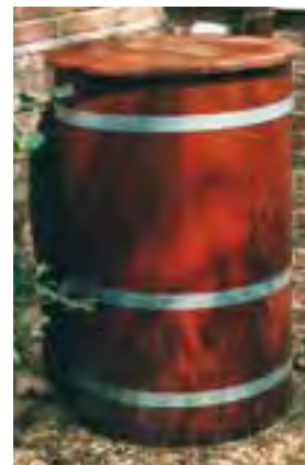
RT K 63