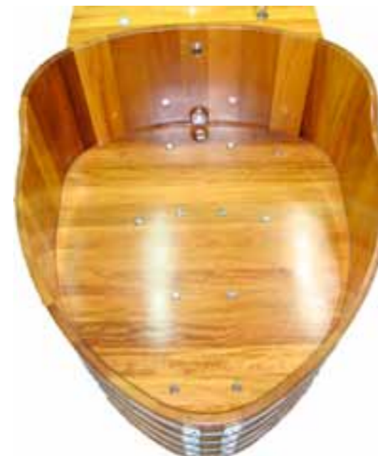
WW K 164x140x70/80 „LoveBoat“, UL PVC, WA head end, UWS, WP-equipment