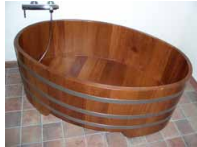
BW K 149x90x60 Kt