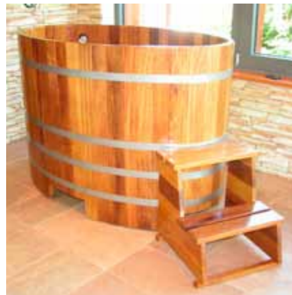
TB K 149x90x100 + K556 + UL MS