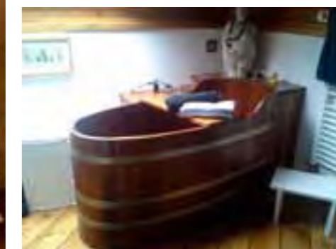
WW K 151x73x70/80, V2A, TAB