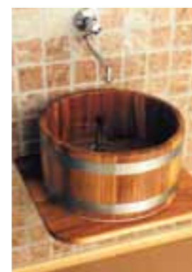
WB K 51, WTP, V2A

Choose between a wash pillar (standing on the floor) or a wash basin to be fixed on a table or panel. Made from larch or kambala wood, clear coated all around with hygienic sealing, with 2 retightenable galvanized hoops, incl. drain with 1¼" male thread and chrome plated overflow pipe (120 mm long). Inside depth 15 cm. We can send you a sketch on request.