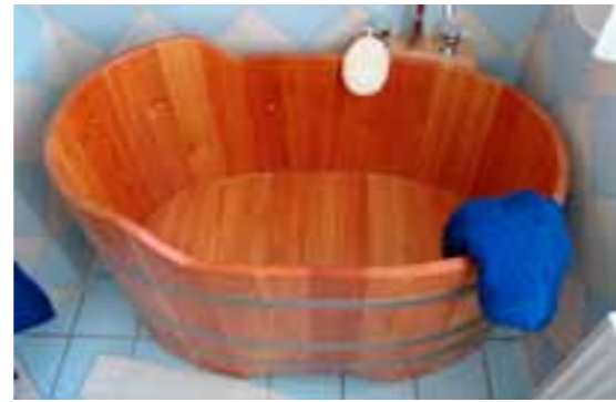
BW L 122x72x65/75 Kt, WA „along the wall“

(*) ... Please add a „K“ or a „L“ to the art.no. (kambala or larch wood).