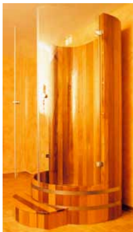
DK RC, V2A DK, ST DK