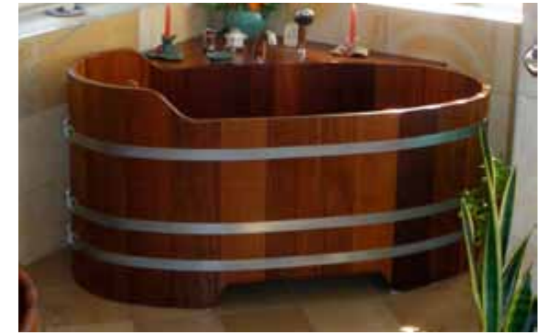
BW K 161x79x70/80 Kt, WA corner diag.