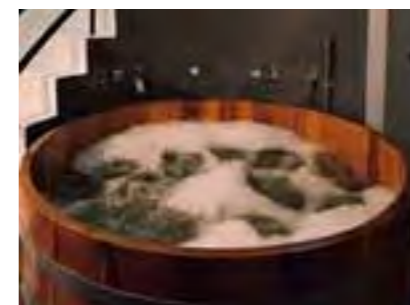
WP K Ø133