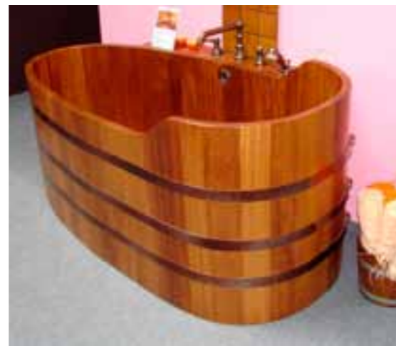
BW K 135x73x60/70 UL PVC, WA along, antik