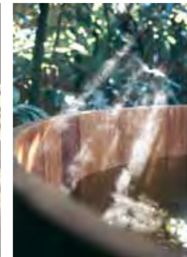
BB K Ø153