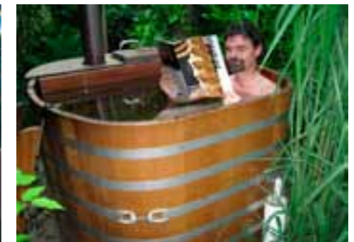
BB K 130x126