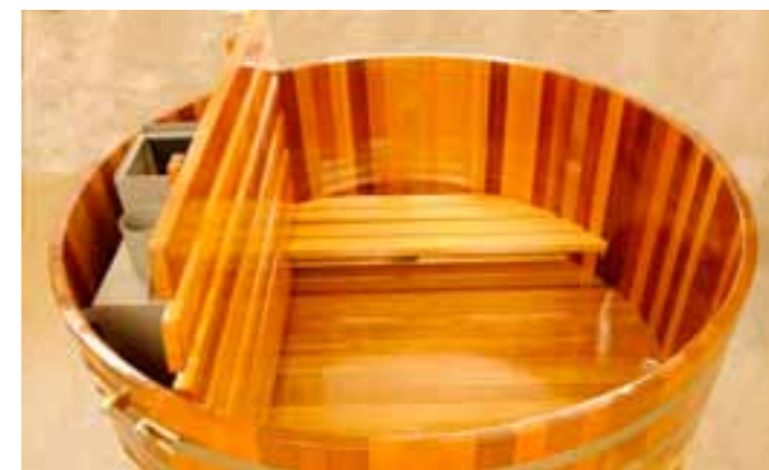
BB RC Ø207