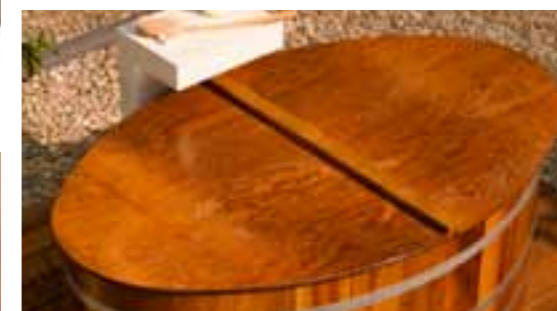
Cover thermo treated plywood / outdoor varnish