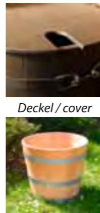
PK Ei Ø45