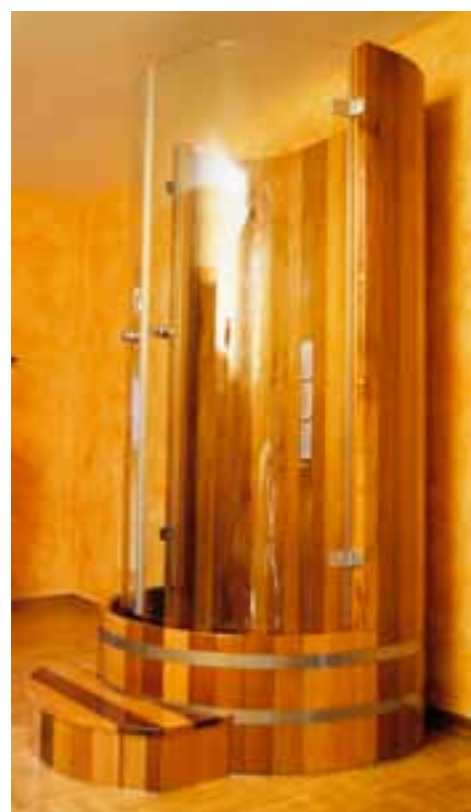
DK RC, V2A DK, ST DK