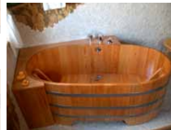
WA corner diag.