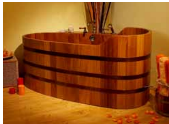
BW K 151x73x70/80 UL PVC, WA corner, antik