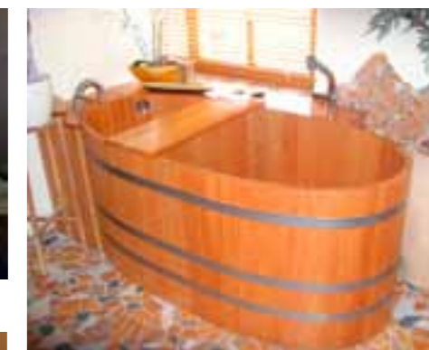
WW L 161x79x70, LB, V2A, TAB