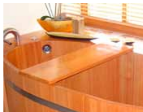
TAB L 80