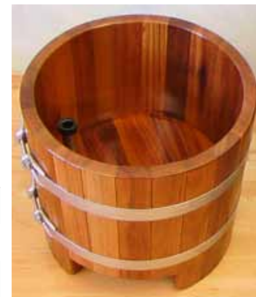
FW K 50/07