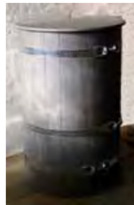
RTL 63 „silver grey“